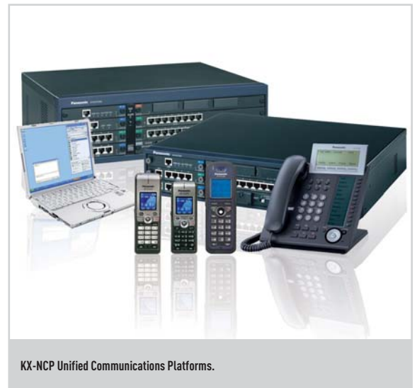
KX-NCP Unified Communications Platforms.

« The Panasonic KX-NCP1000 platform has all the characteristics that meet our needs »»